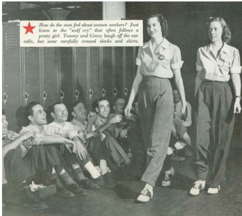
Figure Two: Stuart, “How do the men feel about women workers?” Ladies Home Journal , August 1942, 27.

In the article “This Changing World For Women,” the female authors interweave observations and vignettes throughout that enable the four women to preserve their femininity and reinforce the hope that the women will marry and retreat from the workforce once the men come home. The female workers “proudly wear bright nail polish,” but “their hands are red and sore from handling countless nuts, screws, and bolts.” 29 They fret about dates and grouch over early wakeup calls.