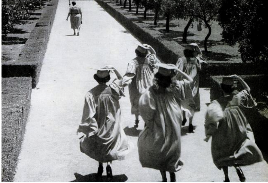
Figure Three: “Late for Graduation,” Life , June 26, 1950, 45.

“look[ed] more like a setting for a schoolgirl romance than for a scholarship.” 60 The women must cross the street to the co-ed Pomona or Claremont Men’s College to study the more masculine disciplines of math, science, and economics. Only ten of the graduates expressed interest in pursuing a career, and many will find their options severely limited.