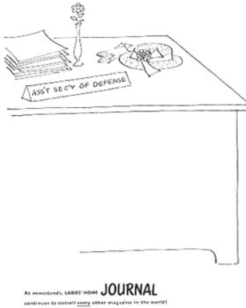
Figure Four: “Never Underestimate the Power of a Woman!” Ladies Home Journal accessed February 14, 2014, www.lhj.com .

Never Underestimate the Power of a Woman!